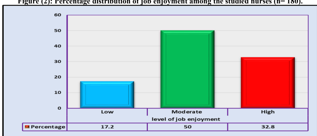
Figure (2): Percentage distribution of job enjoyment among the studied nurses (n= 180).